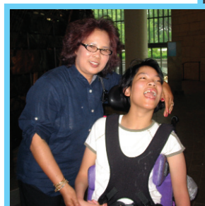
A St. Mary's resident and her mother enjoy time together in Washington, D.C.

The St. Mary's troop became official in November 2005. A volunteer from the community serves as the troop leader, and two key staff