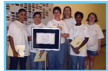
Day of Caring volunteers from The Virginian-Pilot spent the day at St. Mary's, Friday September 7

The Day of Caring also marks the beginning of the United Way's 'season of giving.' It is this time of year when we all fill out our campaign contributions and