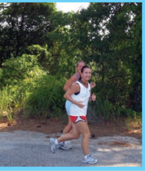
Runners at First Landing State Park enjoy the natural surroundings

What's healthy, scenic and fun? This year's 5K Run! Set in the picturesque tranquility of First Landing State Park, in Virginia Beach, St. Mary's Annual 5K and One-Mile Fun Run takes place Saturday, October 27. What a wonderful time to enjoy the outdoors with your family and friends. Race-day registration begins at 8 a.m. and the 5K starts promptly at 9 a.m. The One-Mile Fun Run is open to everyone and awards will be given out to all those 12-years old and younger. Some